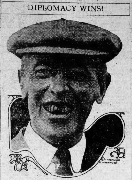
DIPLOMACY WINS! PRESIDENT WOODROW WILSON