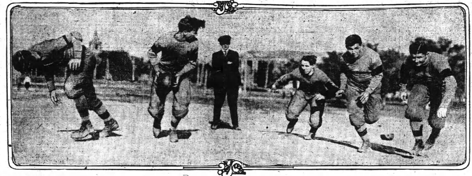
The Mercer backfield in motion, just as it will appear against the Yellow Jackets at Grant Field this afternoon.