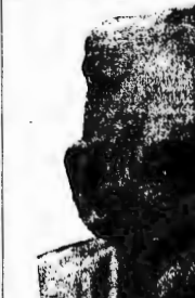
SENATE RECOMMENDS A WAYWARD GIRLS' HOME