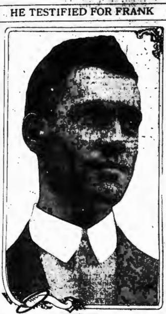
Witness at post mortem, was known to the defense witnesses' laboratory.