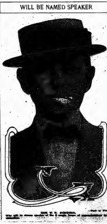
WILL BE NAMED SPEAKER