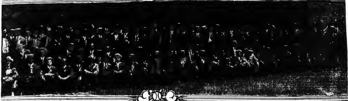
Delegates to attendance of the meeting of the Georgia Retail Hardware Men's association, which convened Wednesday morning. The sessions will continue through Friday morning, when officers for the coming year will be chosen and the next meeting place decided.