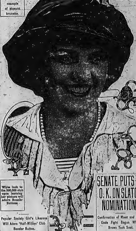
Wires look to the 500,000 club upon learning that Miss Hurst will adorn Booster Buttons.

Victor in the beauty race striking example of elegant brunette.