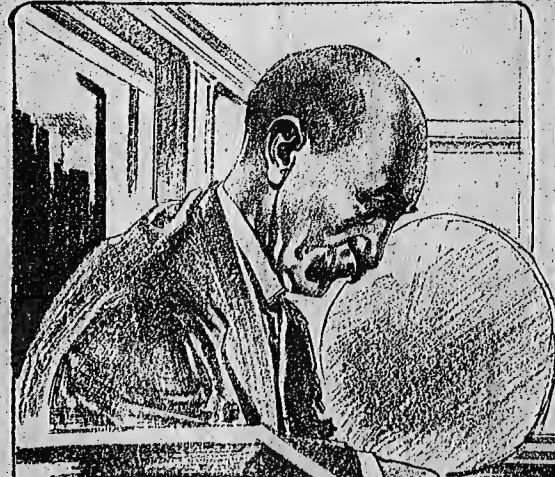
Illustration of the courtroom scene during the trial.

That's nearly what we propose to do," returned Arnold.