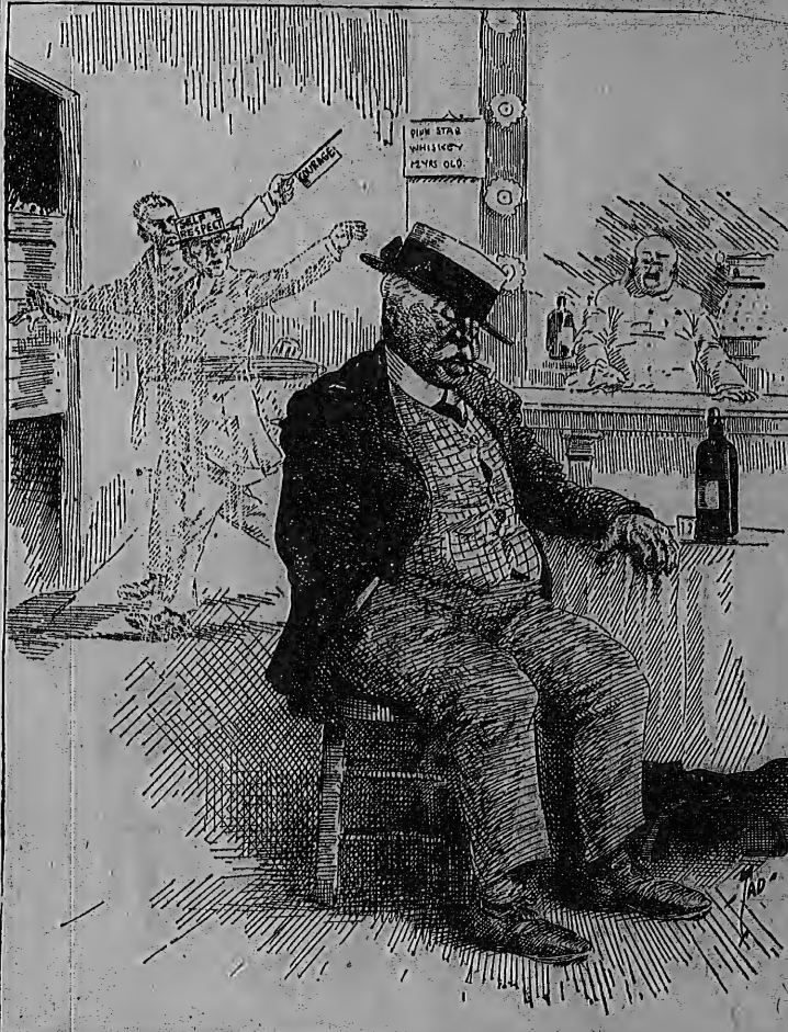
Show him this picture and the two spirits, SELF-RESPECT and COURAGE, walking away from this unhappy victim of his own weakness. This picture may send some drunkard hurrying out of the door to catch up with the friends that have been driven from him. (See Editorial)