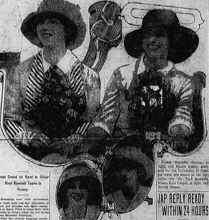
Great Crowd on Hand to Cheer Rival Baseball Teams to Victory.

Brimming over with enthusiasm, the loyal sons and fair adherents of Tech and Georgia will again assemble at Grand Field to cheer their little armies to victory when the two teams meet Saturday afternoon.