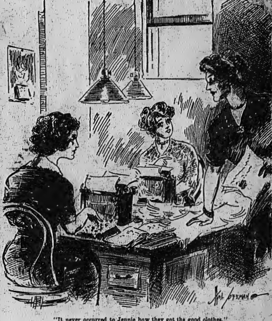
"It never occurred to Jennie how they got the good clothes."