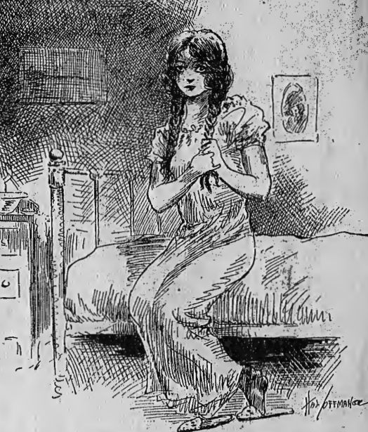
"But, no—mothers always ask so many questions."