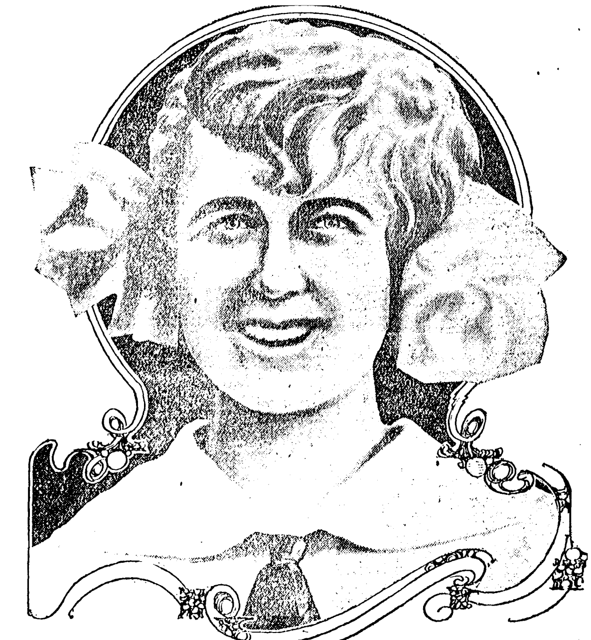
Mary Phagan, the young victim of a most mystifying murder.