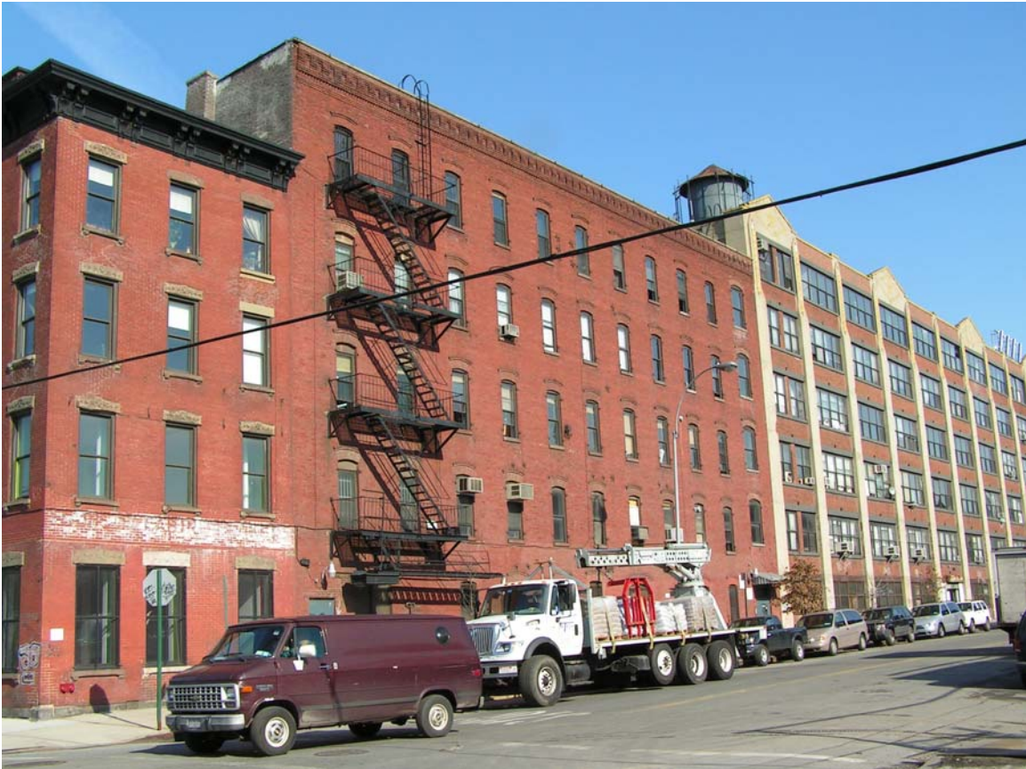
39 to 45 Greenpoint Avenue (at center of view)