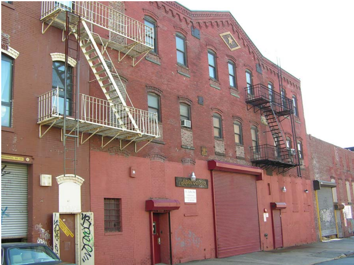
72 to 74 Kent Street