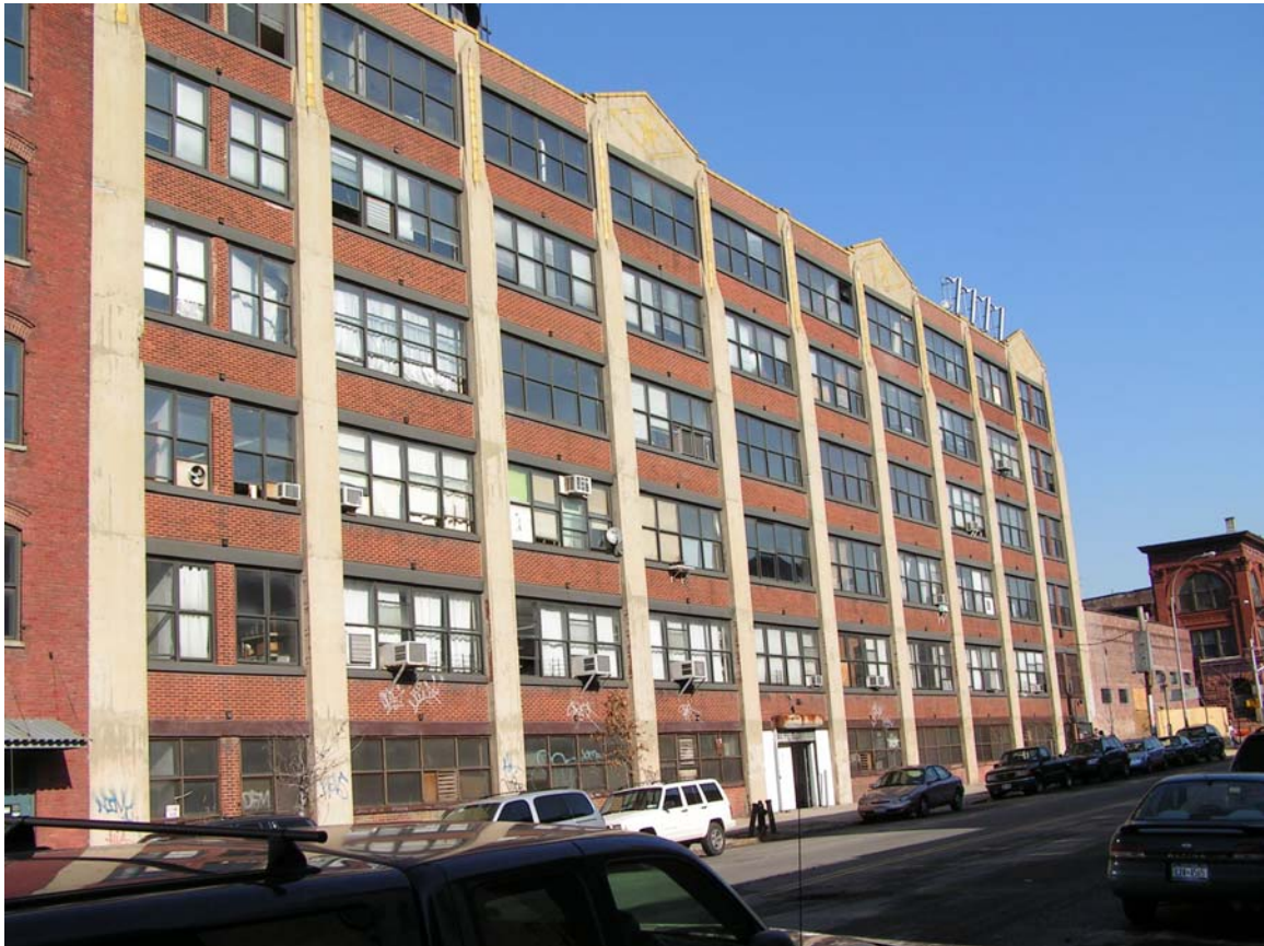
47 to 61 Greenpoint Avenue

Significant alterations: Replacement sash; metal sheathing over window sills and lintels.