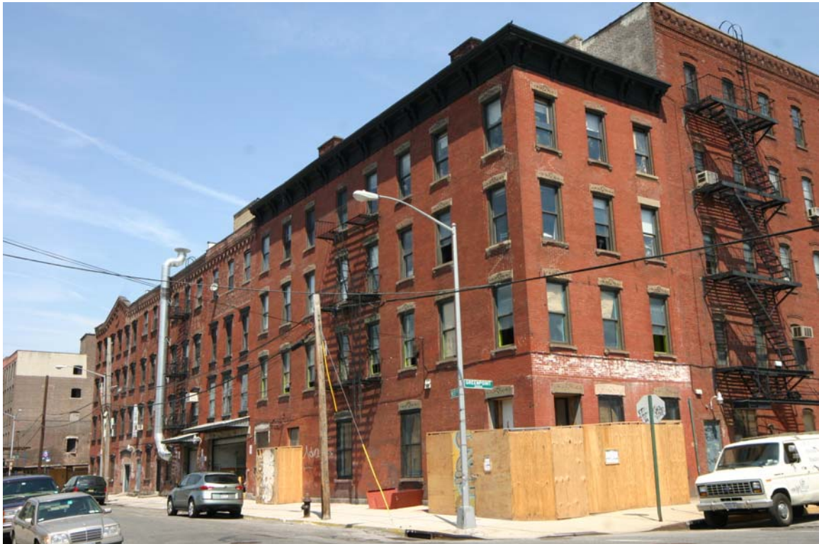
37 Greenpoint Avenue ( at the corner )