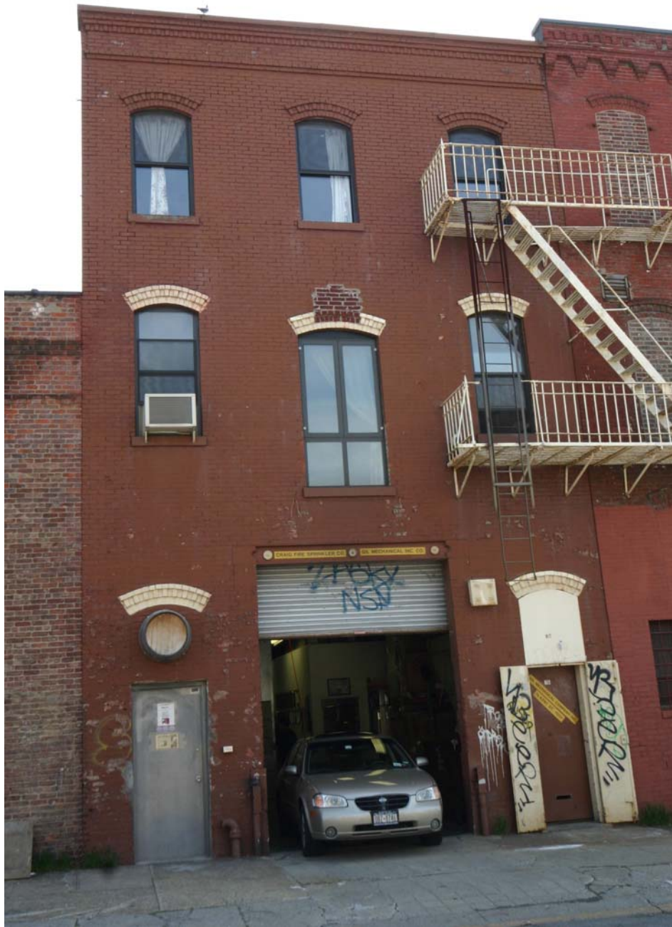
76 Kent Street