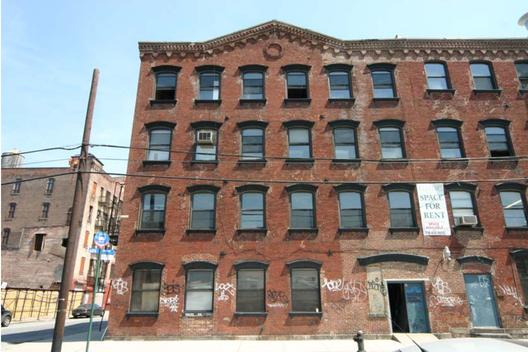
100 to 106 West Street, a/k/a 50 to 56 Kent Street ( West Street Façade )