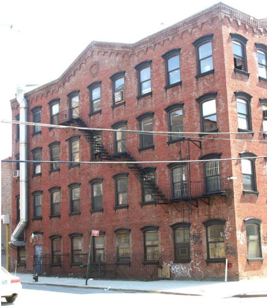
100 to 106 West Street, a/k/a 50 to 56 Kent Street ( Kent Street Facade )

building at 98 West Street by Philemon Tillion. Tillion was a local architect, who began his practice in 1888. He also designed a row of flats in the Greenpoint Historic District. Tillion chose to continue the look of the earlier Faber buildings by incorporating triangular pediments with circular medallions. The bracketed, cast-iron window sills and segmental cast-iron window hoods decorated with acanthus leaves identify the building's original Italianate style. Sections of the ground story have been altered, and the eastern wing of the building was demolished in the mid-twentieth century, but the remaining building is largely intact.