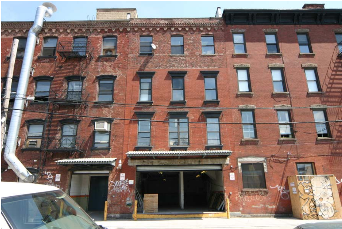
98 West Street (at center of view)

Significant Alterations: c.1881 (Alt 645-1881); c.1901 (ALT 1736-1901; P. Tillion, architect)