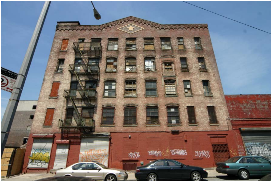
59 to 63 Kent Street

characteristics of the German Renaissance Revival style, such as a central pediment, brick corbelling, and segmental fenestration, as well as featuring the company's star within a diamond logo. Prior to 1940, an iron bridge connected the building, via the fourth story, to a building that originally stood on the south side of Kent Street. The fire escape, at the west end of the façade, is historic, and dates from before 1940. Although the ground floor façade appears to have been altered, the building remains largely intact.