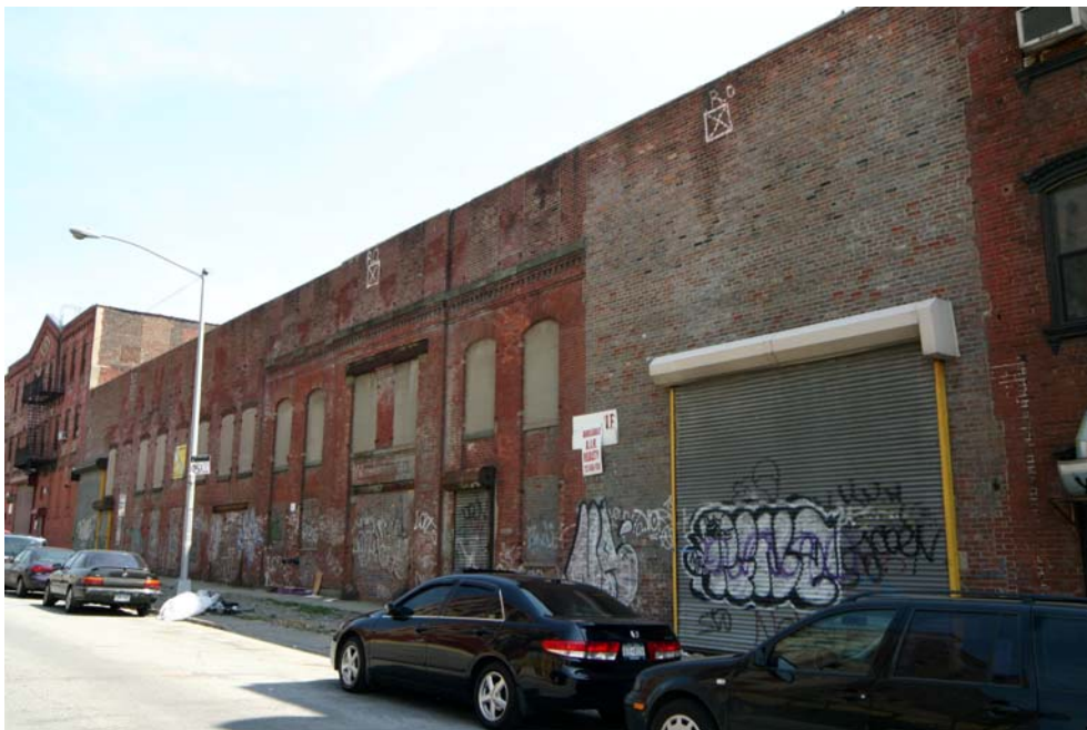
58 to 70 Kent Street